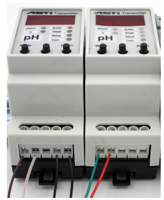
Input terminals close-up of PtD sensor to 2 ea 3TX-pH