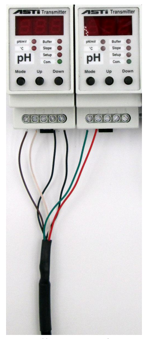
Overall wiring wide view

For the second 3TX-pH transmitter used to connect the ORP portion of the Dual All-In-One "PtD" style sensor, please ensure that P05 is selected as "Set" to be in manual temperature mode to ensure normal operation.