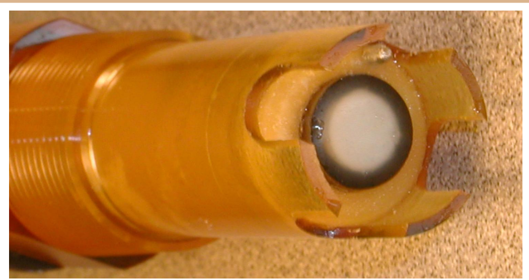
Case Study No. 7 – Total Ammonia Analysis in Wastewater

Total Ammonia Determination through online ammonium ion and pH monitoring